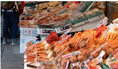
Sapporo Fish Market - Nijo Market Explore the vibrant Nijo Market, Sapporo's historic fish market. Discover stalls overflowing with Hokkaido's freshest seasonal seafood, where you can browse local delicacies and enjoy an authentic morning market atmosphere in the heart of the city.