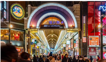
Tanukikoji Shopping Street & Local product Shops sell kimonos, musical instruments and other specialty merchandise. There are also video arcades and movie theaters. Shops with long histories stand next to newly opened Mall. Shop as you stroll the arcade.