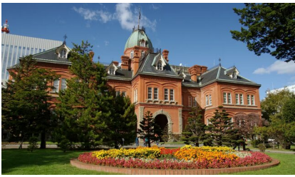
Former Hokkaid Government Office Building The First American style Government Building.