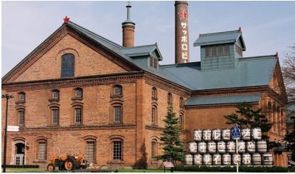
Beer Factory Visit the historic Beer Factory in Sapporo, a landmark famous for its iconic red-brick architecture and rich brewing heritage. Discover the history of one of Japan's oldest and most popular beer brands in the city where it was founded.