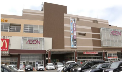
Aeon Mall Enjoy Shopping