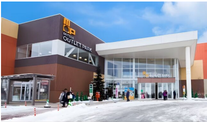
Outlet Enjoy a premium shopping experience at the Mitsui Outlet Park, Hokkaido's largest outlet mall. Browse a wide selection of international and local designer brands, offering tax-free shopping and great discounts on fashion, sportswear, and lifestyle goods.