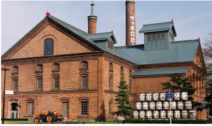
Beer Factory Visit the historic Beer Factory in Sapporo, a landmark famous for its iconic red-brick architecture and rich brewing heritage. Discover the history of one of Japan's oldest and most popular beer brands in the city where it was founded.