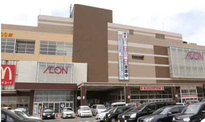
Aeon Mall Enjoy Shopping