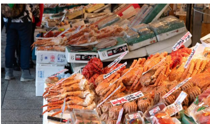
Sapporo Fish Market - Nijo Market Explore the vibrant Nijo Market, Sapporo's historic fish market. Discover stalls overflowing with Hokkaido's freshest seasonal seafood, where you can browse local delicacies and enjoy an authentic morning market atmosphere in the heart of the city.