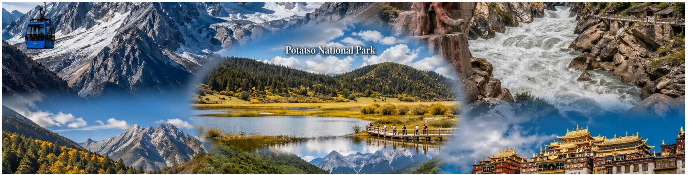
Potatso National Park