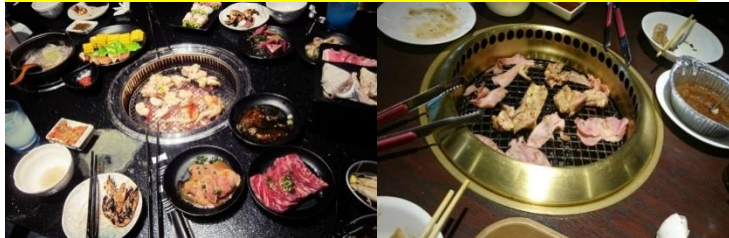
日式烧肉自助餐+饮料 (任吃) Japanese BBQ( eat all you can)