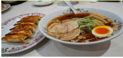
北海道拉面套餐 Hokkaido Ramen Set meal