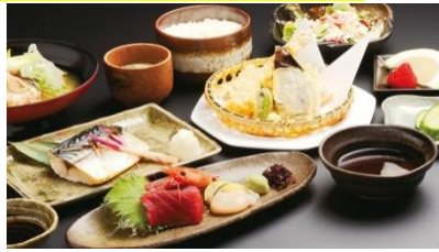
日式风味餐 Japanese Cuisine