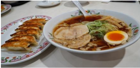
北海道拉面套餐 Hokkaido Ramen Set meal