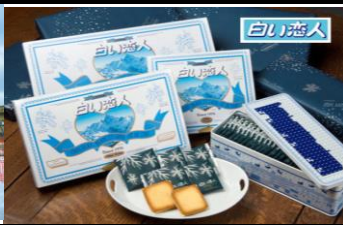
Shiroi Koibito Park & White Chocolate Factory (included entrance fee)